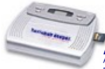
Kustomer Keeper ® All-digital playback system.